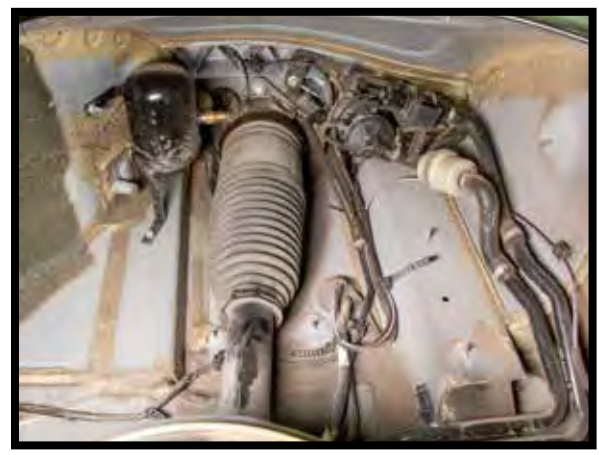
FIGURE 2 FIGURE 3

5. LOCATE AND DISCONNECT THE ELECTRICAL CONNECTOR. (FIGURES 4, 5)