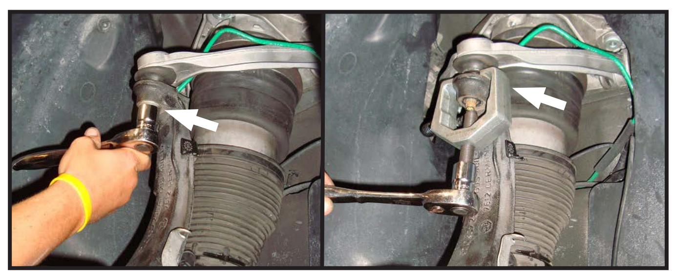
FIGURE 10-4 FIGURE 10-5

6. REMOVETHE BALL JOINT NUT FROM THE SPINDLE ASSEMBLY, AND SEPARATE. (FIGURES 10-4, 10-5)