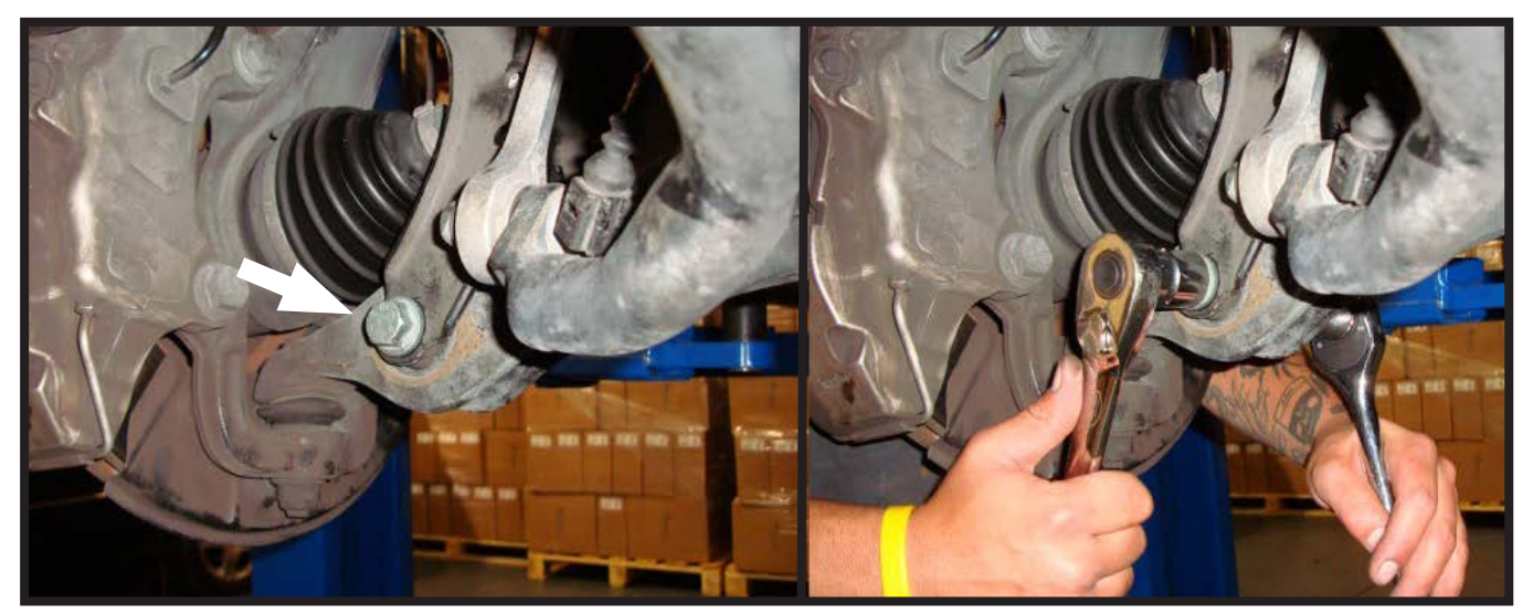
FIGURE 10-2 FIGURE 10-3

5. REMOVETHE LOWER SHOCK-MOUNTING NUT AND BOLT. (FIGURES 10-2, 10-3)